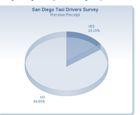
84% of drivers do not receive receipts for the thousands of dollars they pay in lease fees every week.