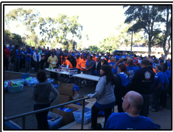
Filner campaign volunteers.